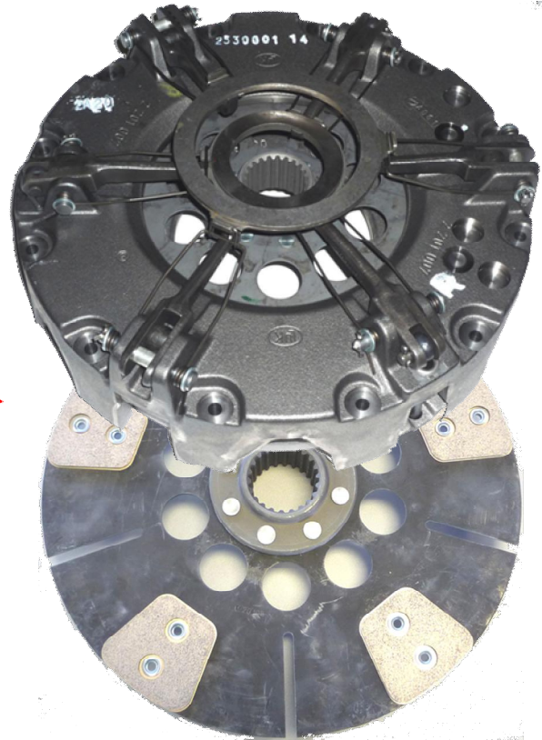
233 0001 14 (331 0006 16) 310UKC

**For model information please see LuK Catalogue / Die genaue Fahrzeugzuordnung entnehmen Sie bitte dem LuK-Katalog / Pour les informations le modèle veuillez consulter le catalogue LuK / Para obtener información sobre el modelo, rogamos consulte el catálogo de LuK / Per informazioni sul modello consultare il catalogo LuK