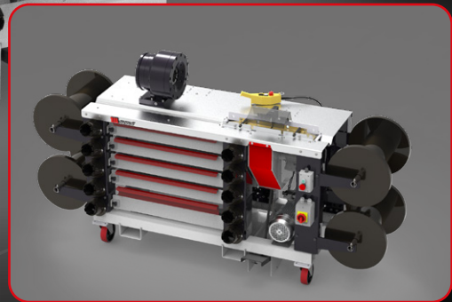
MRB 137 EVO R version